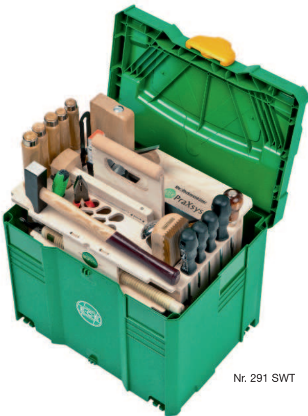
Nr. 291 SWT