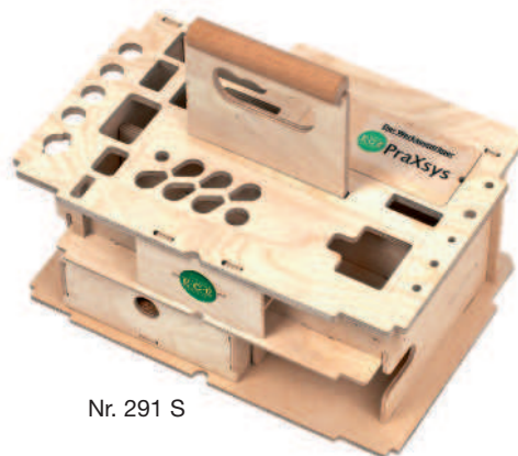
Nr. 291 S